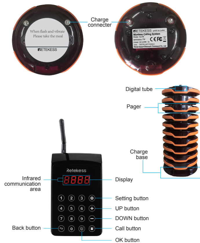
Diagram of Hardware